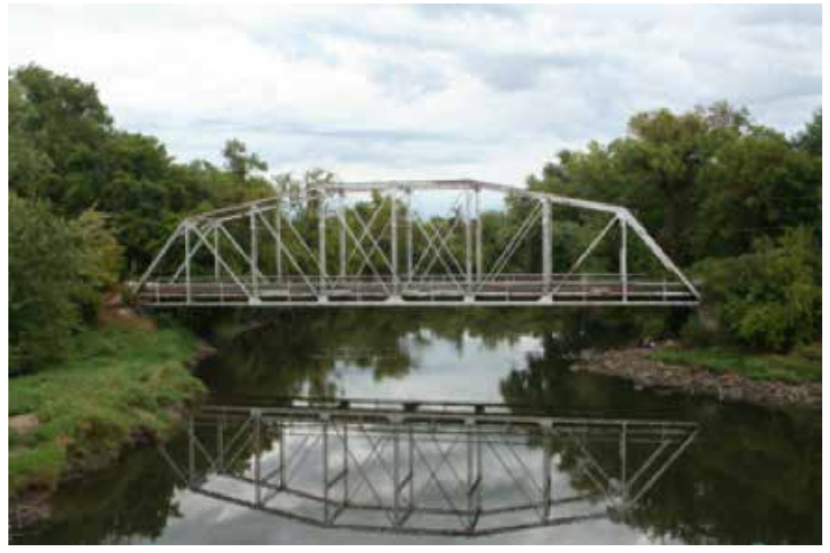
Truss bridge in Waterford Township (Dakota County, MN)