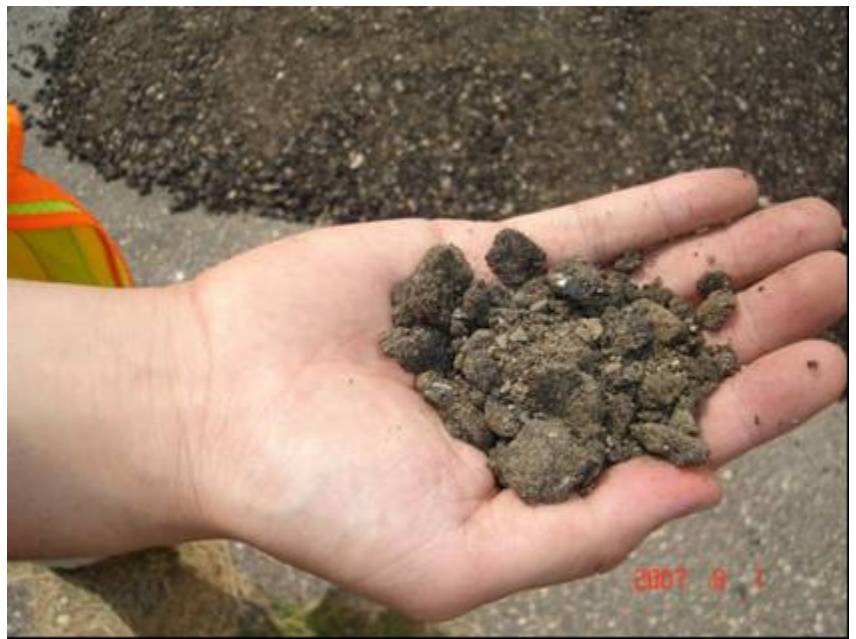
Recycled Pavement Materials on Site

"The construction process itself went quite smoothly" says Tim Clyne, "A vibratory padfoot roller is necessary for compaction, and the motor grader needs to be on top of things to get the material bladed quickly. MnROAD experienced an extraordinary amount of rain over the summer, and the fly ash stabilized section was able to support the hot mix trucks during paving operations while the non-stabilized sections were not."