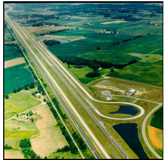
Aerial Photo of MnROAD Site