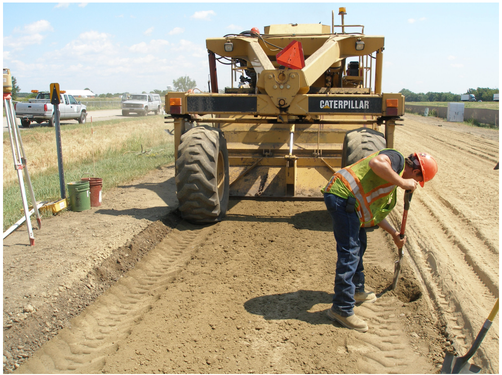
Fly Ash Stabilization: before mixing with RPM (right) and after mixing (left)