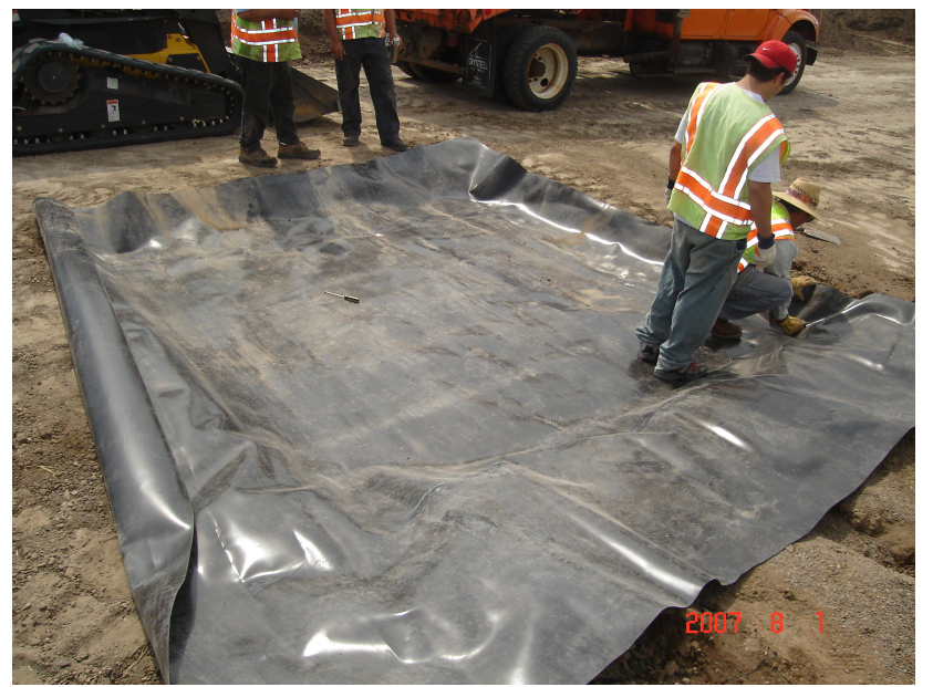
Installation of Lysimeter to Collect Leachates from Base Materials

Leachate has been collected on a monthly basis. Laboratory characterization is underway. The leaching water in the storage tanks are sampled and amount of leaching water are recorded. In the meantime, laboratory characterization of materials sampled during the construction is underway. These lab results are being compared to the field tests results.