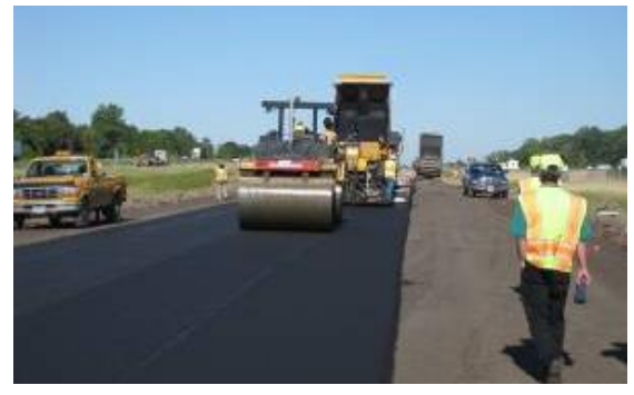
Producing the Warm Mix Asphalt at MnROAD went smoothly; no smoke behind the paver provided cooler working conditions for the paving crew.

The study is also monitoring other performance measures such as rutting, fatigue cracking, top-down cracking, and ride.